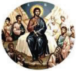
The Eight Beatitudes