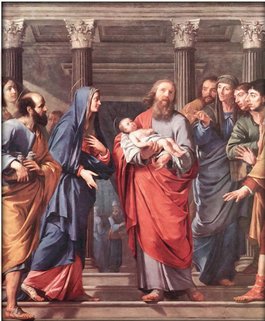
Saint Joseph the Worker Bonneauville, Pennsylvania