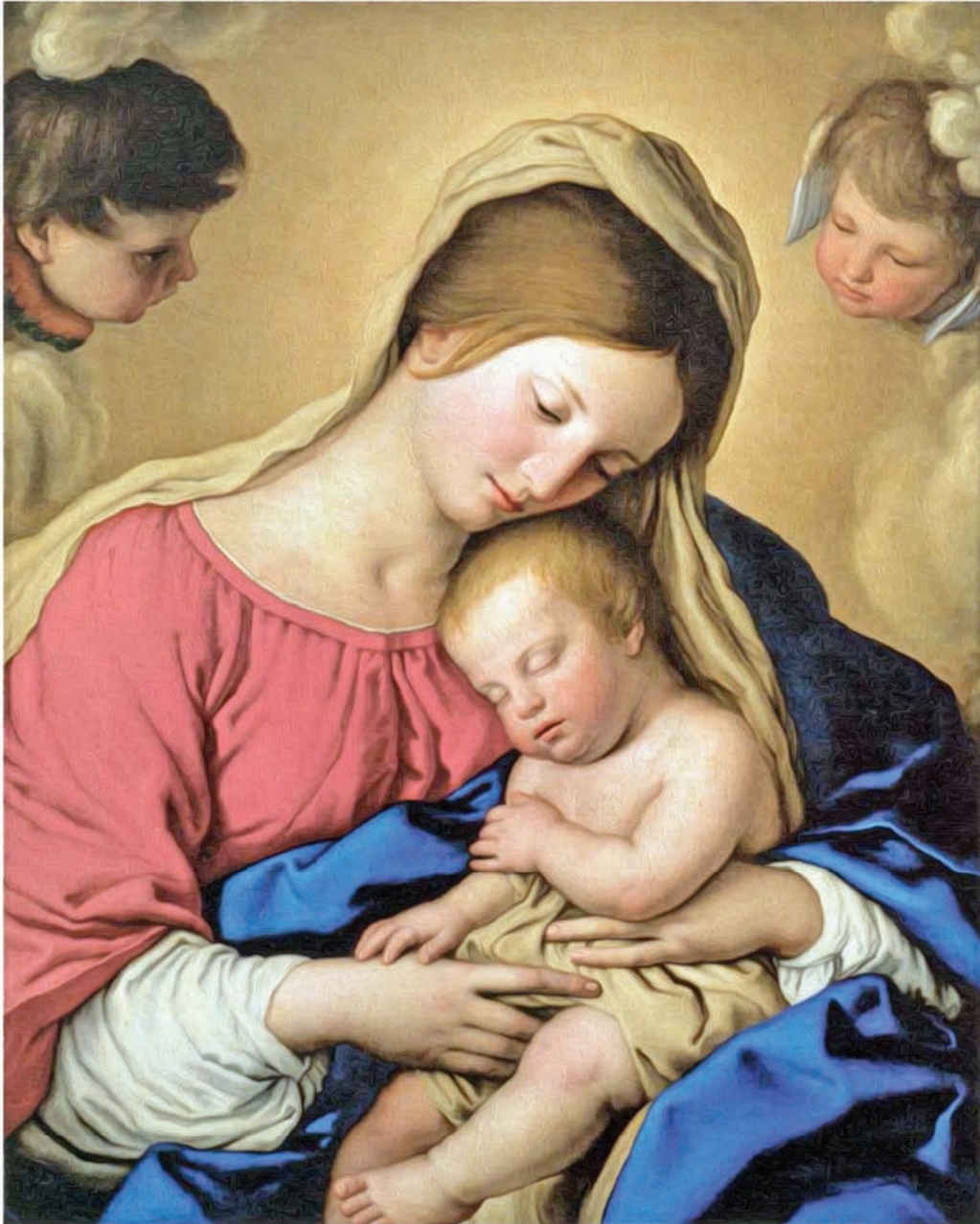
Saint Joseph the Worker Bonneauville, Pennsylvania